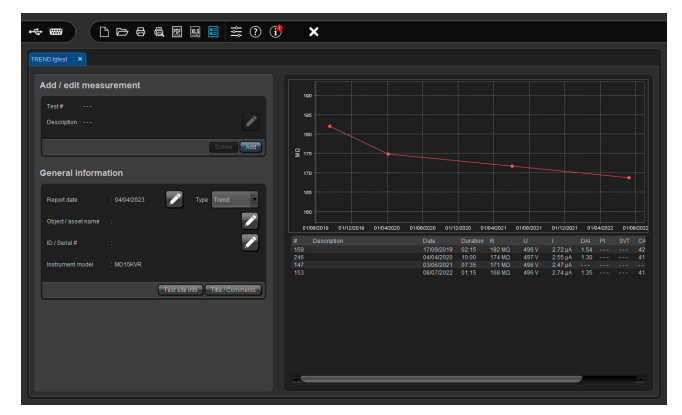
Trend analysis (insulation testers and micro-ohmmeters)