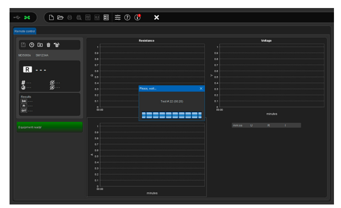
Download internal memory